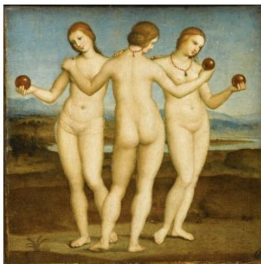
Figure 5: Raphael, "The Three Graces", 1503-1508, oil on panel.

Typically when we hear Italian art, we first think of the Italian Renaissance , which exemplified hyperrealism. Michelangelo focused on the definition of idealized male musculature, as seen in many of his works, for example, the "David" (Fig. 3). Leonardo Da Vinci's "Vitruvian Man" transforms the proportions of the human body into calculated perfection (Fig. 4). Raphael also depicted the realistic bodies of the "Three Graces" emphasizing their natural yet balanced curves (Fig. 5). However, Marini's figures are far from the expectations of the Renaissance viewer. The sculptures are not meant to represent an idealized female nude, but rather a body that represents an idea.