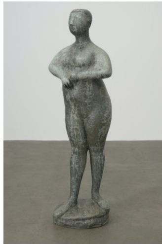
Figure 1: Marino Marini, "Venere" (Venus), 1945. terracotta.

Marini's "Danzatrice" (Dancer) has minimal facial features drawing the viewer's eye to the more highly finished body (Fig. 1). Furthermore, most of his nudes do not even include a head or other extremities. Marini's archaic influence can be seen in his "Venere" (Venus) sculpture (Fig. 2). In this piece, he chooses to focus more on the torso, excluding the figure's upper extremities. My observation here is that Marini's focus on the body instead of the face is a way for him to represent femininity as a collective idea rather than for the sculptures to identify a specific person.