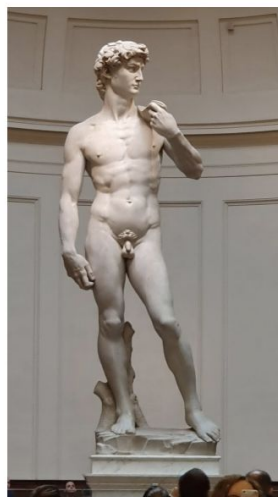
Figure 3: Michelangelo, "David", 1501-1504, marble.